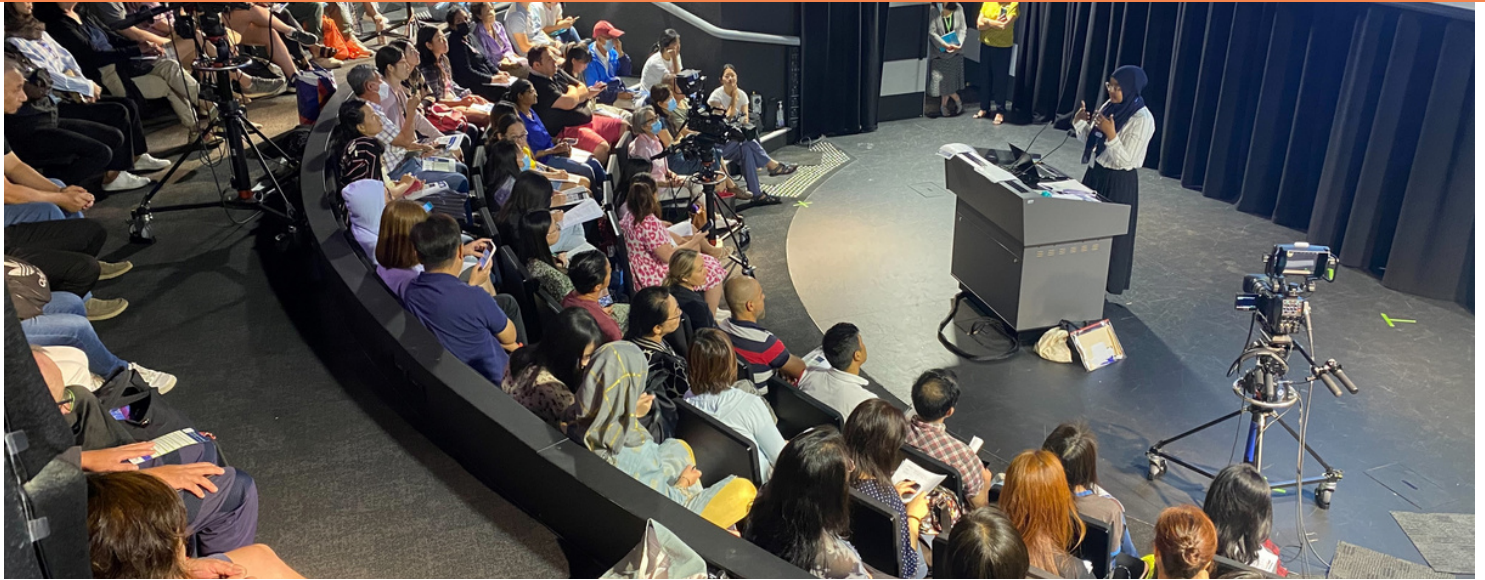
Health System Navigation presentation to students at Upper Mt Gravatt TAFE

A project delivered by Mater Refugee Health and funded by Brisbane South PHN (July 2022- June 2023)