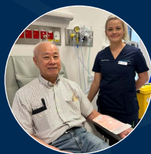
Cancer day unit

The Eight Mile Plains Satellite Hospital will also provide the following appointment based services: