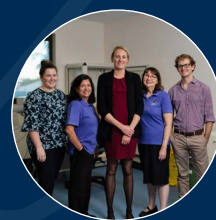
Allied health services